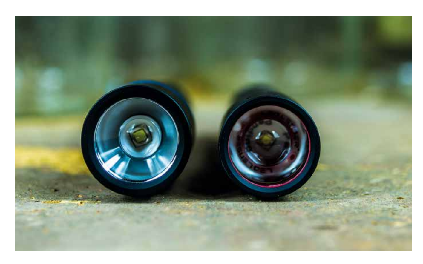
Similar, but not identical. The PL80 (left) has a Cree XM-L2 LED, whereas the P7.2 has a Cree XP-G2. The head of the PL80 is slightly larger for technical reasons.

the switch on the tail cap. Walther will soon be offering a similar solution, which will be screwed into the head in place of the blue ring.